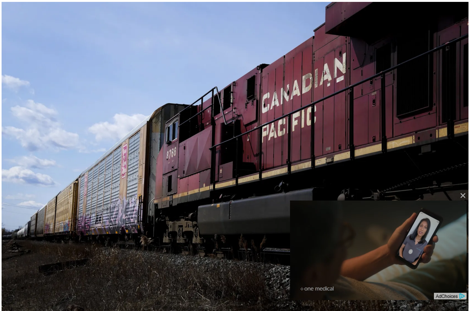
Canadian Pacific will be allowed to merge with Kansas City Southern after a ruling Wednesday by the U.S. Surface Transportation Board.